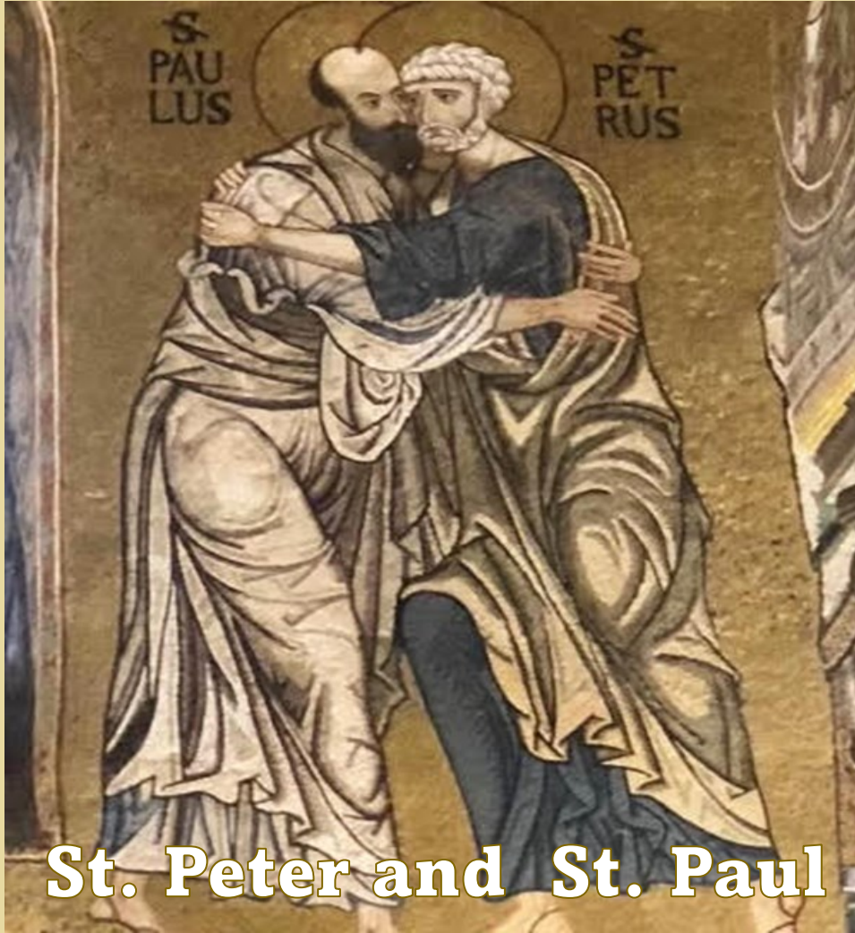
St. Peter and St. Paul

To All who are weary and need rest; To All who are lowly and want friendship; To All who mourn and need comfort; To all who pray and all who do not, but ought; To All who sin and need a Savior, and to whomsoever will come... The Church opens the door and says in the name of the Master